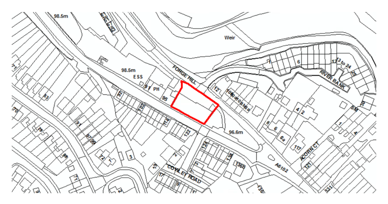
© Crown copyright and database rights 2016 Ordnance Survey 10018816